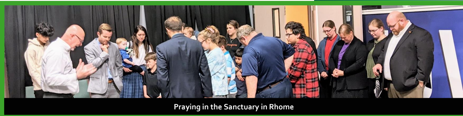
Praying in the Sanctuary in Rhome