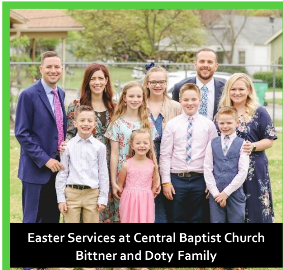
Easter Services at Central Baptist Church Bittner and Doty Family