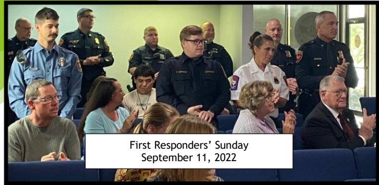
First Responders' Sunday September 11, 2022